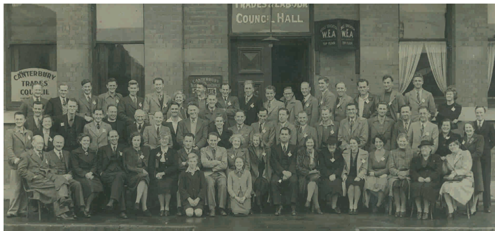
The 1946 Peace conference in Christchurch.